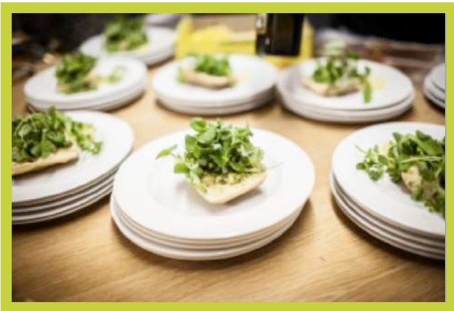
At Stratton Court Barn you have a list of approved caterers to choose from