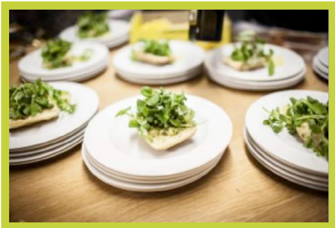
At Stratton Court Barn you have a list of approved caterers to choose from