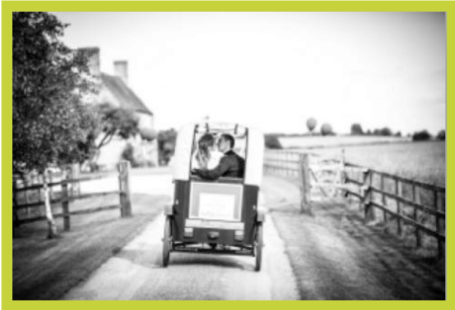
Bride and Groom arriving at Stratton Court Barn